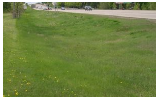
Photo of a dry swale.

Green Infrastructure: Swales can be an important tool for retention and detention of stormwater runoff. Because they utilize vegetation, swales provide additional benefits, including cleaner air, carbon sequestration, improved biological habitat, and aesthetic value.